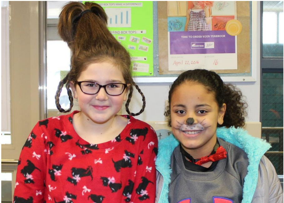
Dr. Seuss Dress Up Day at Aiken!